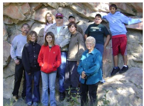
Group picture in front of the hieroglyphics