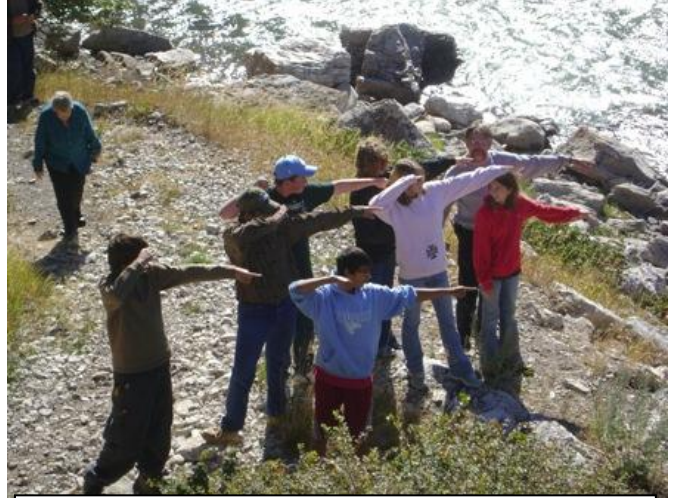
The class points to the dam and waits for the picture to be taken.