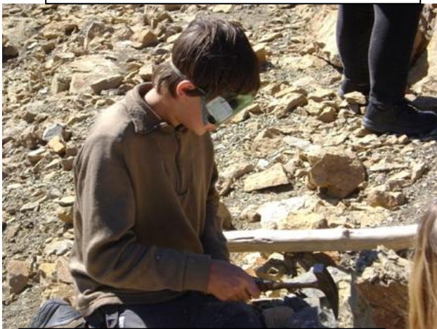
Steady now, steady!!!