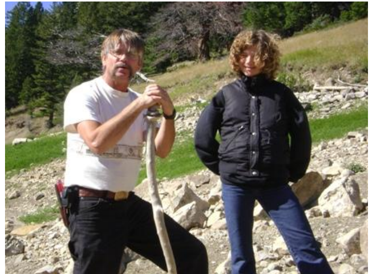
Chaperones or really big kids?